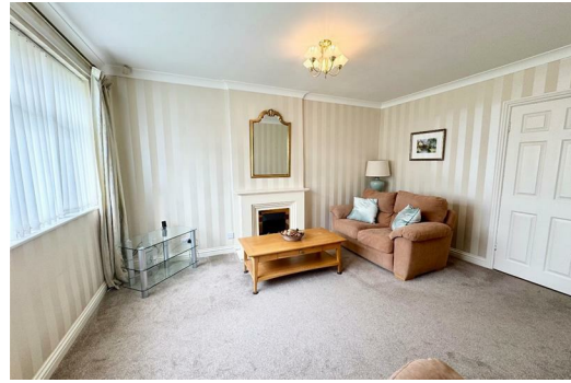
Immaculately Presented Semi-Detached Bungalow – No Onward Chain

This beautifully maintained semi-detached bungalow is offered to the market with vacant possession and no forward chain, making it ready for immediate occupancy. Ideally suited for those looking to downsize, the property provides comfortable, low-maintenance living – all on one level.